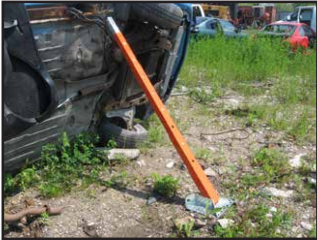
Pro-1 Rescue Strut 8ft shown in application

Tuff Built's unique, lightweight and patent pending pinless rescue struts are designed to provide economic solutions for motor vehicle accident scenes where vehicle stabilization is required.