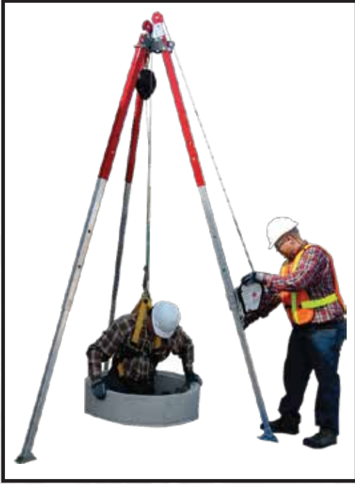
Pro-4 Rescue Tripod shown being used as standard Tripod setup

Tuff Built Product's Pro-4 Series Tripod Rescue system combines a fully functional tripod with a support structure for cantilever rescue operations. The rescue system features "Tuff-Klik" pin-less adjustment, which eliminates lost or damaged locking pins.