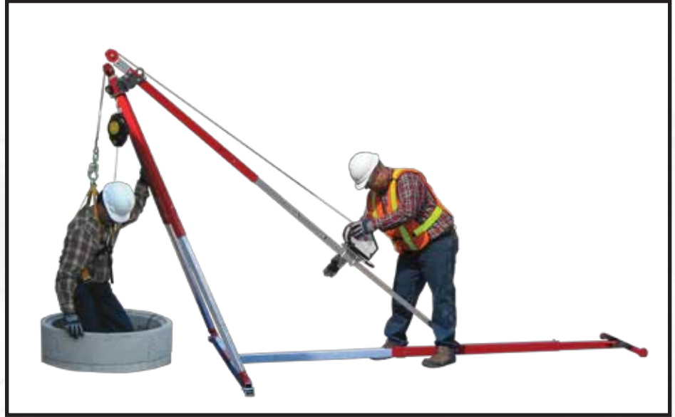
Pro-4 Rescue Tripod shown being used in a cantilever setup